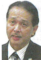
Datuk Dr Noor Hisham Abdullah

"A total of 1,362 undocumented immigrants have been treated here (at MAEPS). However, up to today (yesterday), only 11 patients are being treated there. A total of 1,241 or 99.1 per cent of patients have been discharged."