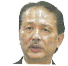
Jumlah kes aktif dengan kebolehjangkitan COVID-19 adalah 344 kes. Mereka telah diasingkan dan diberi rawatan. Dr Noor Hisham Abdullah, Ketua Pengarah Kesihatan

Jun lalu. "Aktiviti pengesanan kes secara aktif mendapati ahli keluarga beliau juga positif COVID-19 membabitkan ibu, bapa dan dua adik-beradiknya. "Seorang rakan kepada bapa kes ini juga didapati positif COVID-19, menjadikan ia sebuah kluster baharu di Kidurong. "Susulan itu, siasatan dan saringan kontak rapat dijalankan dengan membabitkan seramai 231 orang dikenal pasti, setakat ini. "Seramai 163 orang sudah disaring dan kesemua mereka negatif COVID-19. Punca jangkitan masih dalam siasatan," katanya.